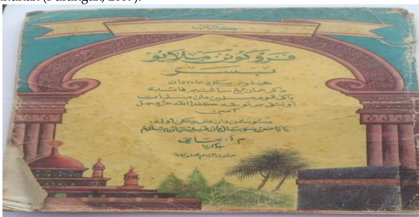
Picture 3. The Book of Parukunan