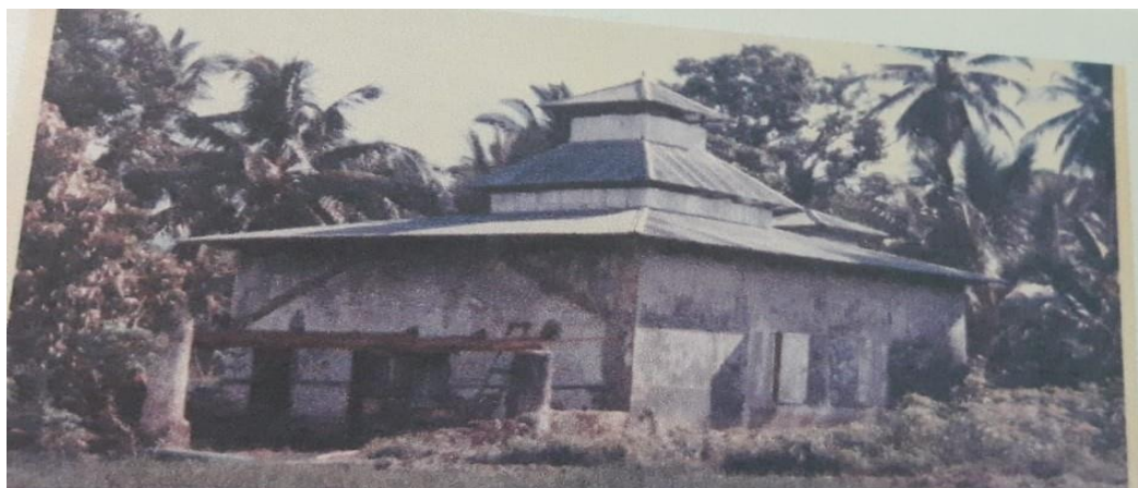
Image: Sheikh Zainal Abidin Mosque 1987